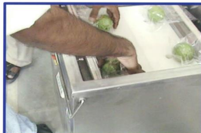
PACKAGING OF GUAVA FRUITS USING VACUUM PACKAGING MACHINE

The farmers, processors and exporters are recommended to adopt packaging technique developed by Junagadh Agricultural University for increasing the shelf life of guava fruit up to 18 days at room temperature by packing in 50 \mu polyethylene bag at a vacuum level of 700 mm Hg.