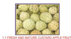
1.1 FRESH AND MATURE CUSTARD APPLE FRUIT

The processors and exporters are recommended to adopt freeze drying technique developed by Junagadh Agricultural University for preparing custard apple powder by freeze drying of fresh custard apple pulp (1.5 kg) pretreated with 5 % maltodextrine at -40^{\circ}\text{C} temperature with a drying period of 41 hours. The custard apple powder obtained by this method has better product quality and could be stored up to 90 days at room temperature when packed in 50 \mu polyethylene bag at a vacuum level of 700 mm Hg.