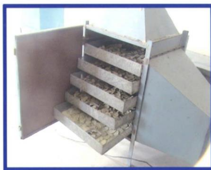
LOADING OF DRYING TRAYS IN THE DRYING CHAMBER.